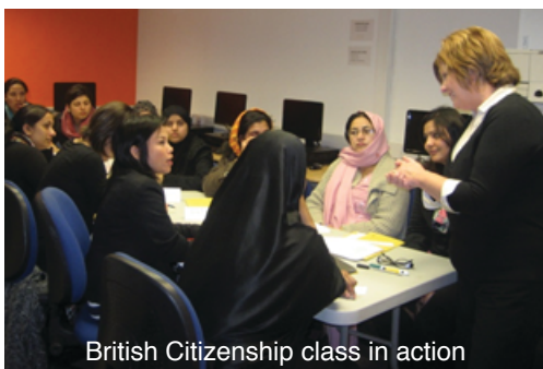
British Citizenship class in action