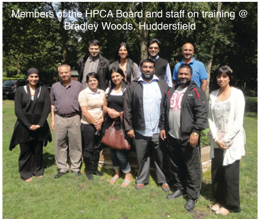
Members of the HPCA Board and staff on training @ Bradley Woods, Huddersfield

Kirklees Youth Integrated Youth Services Joseph Rowntree Trust Princes Trust Children in Need Heritage Lottery Fund Workers Education Association Gateway to Care West Yorkshire Police Community Trust QED-UK (Bradford) University of First Age (UFA) North Huddersfield Trust School British Army