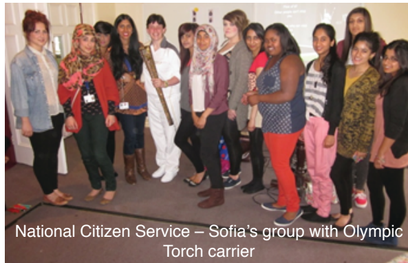
National Citizen Service – Sofia's group with Olympic Torch carrier