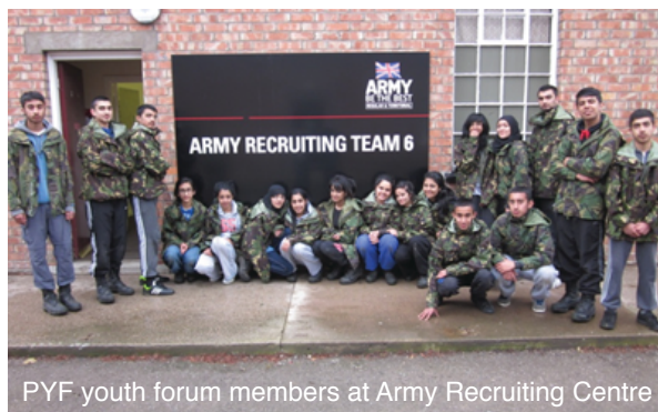
PYF youth forum members at Army Recruiting Centre