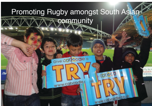
Promoting Rugby amongst South Asian community

Based on the success of engagement and delivery in the Thornton Lodge area, HPCA has been invited support to deliver an additional session in the Birkby area from the Birkby Community Centre. This is a welcome extension of the provision, although one session does not allow HPCA to offer a culturally flexible provision similar to that in Thornton lodge. This may be the reason that so few young women attend the session.